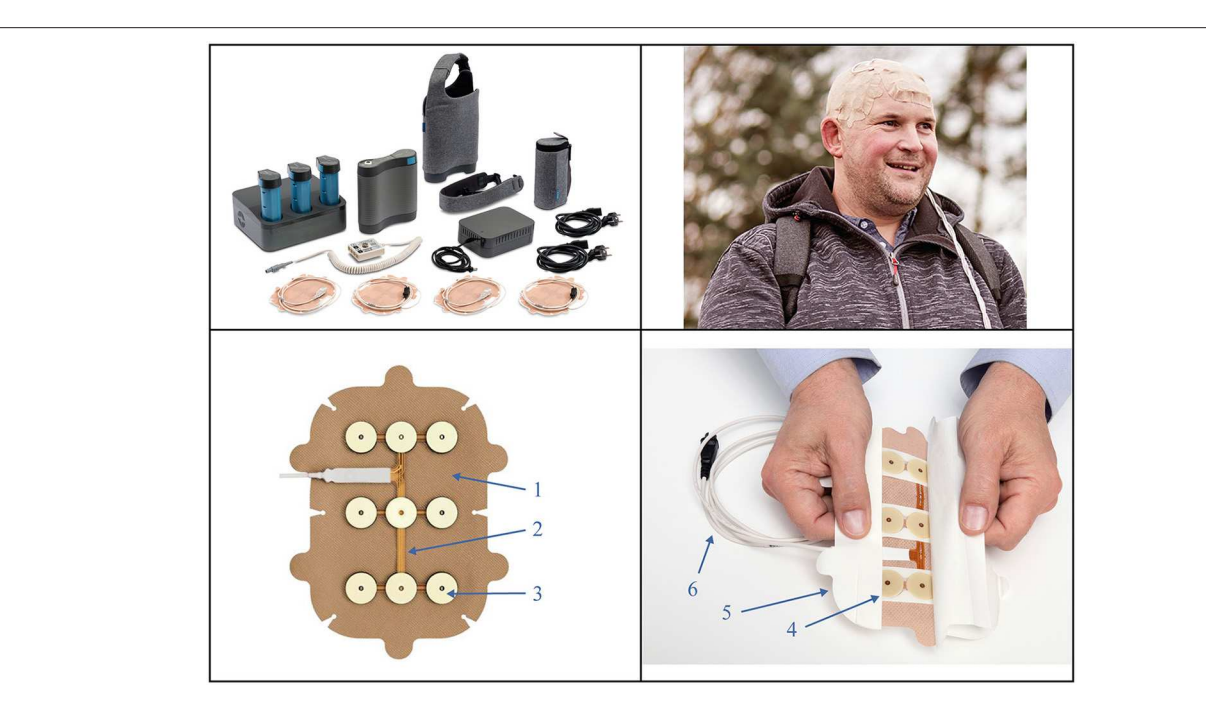
FIGURE 1 | The Tumor Treating Fields (TTFields) device and transducer arrays. Top left panel: second generation (Gen 2) battery-operated field generator device, portable battery packs, plug-in power supply, tan transducer arrays, connection cables and box, and carrying case. This results in an increased operational efficiency and improved patient experience. Top right panel: Shows a patient* with glioblastoma during therapy, wearing the tan transducer arrays on his scalp. Bottom panels: 1 . A hypoallergenic cover tape holds tan arrays in place on the scalp. 2 . Transducer arrays deliver low intensity, intermediate frequency (200 kHz) alternating electric fields and monitor the temperature of the scalp. 3 . Conductive hydrogel layers ( top ) ensure separation between the arrays and skin, and the ceramic disks ( beneath ) transmit TTFields without direct contact with the skin. 4 . Mid-pads mechanically stabilize the gel over the arrays. 5 . An overlapping liner covers the gel and cover tape. 6 . A cable connects array to the connection box. * Permission for global image use was obtained from the patient .