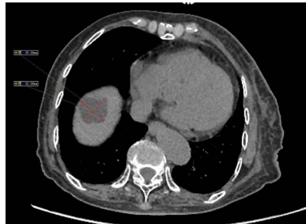
FIGURE 3 | Before the fourth immunotherapy by sintilimab, the liver metastases showed no obviously change.

suppresses its production (10). Patients with gastric carcinoma have increased IL-4 level (11), which may interfere with the production of fibrinogen. Further studies are needed to explore whether cytokines modulate fibrinogen level via interaction with each other. We will evaluate IL-4 and other cytokines in the patient's follow-up visits to verify the relationship between cytokines and hypofibrinogenemia. Secondly, hypofibrinogenemia may stem from impaired liver function, which would be manifested as prolongation of PT or elevation of transaminases (12). However, our patient's index of liver function was normal, as transaminases and bilirubin were within the normal ranges; therefore, it could not be a reliable explanation for low fibrinogen level in this patient.