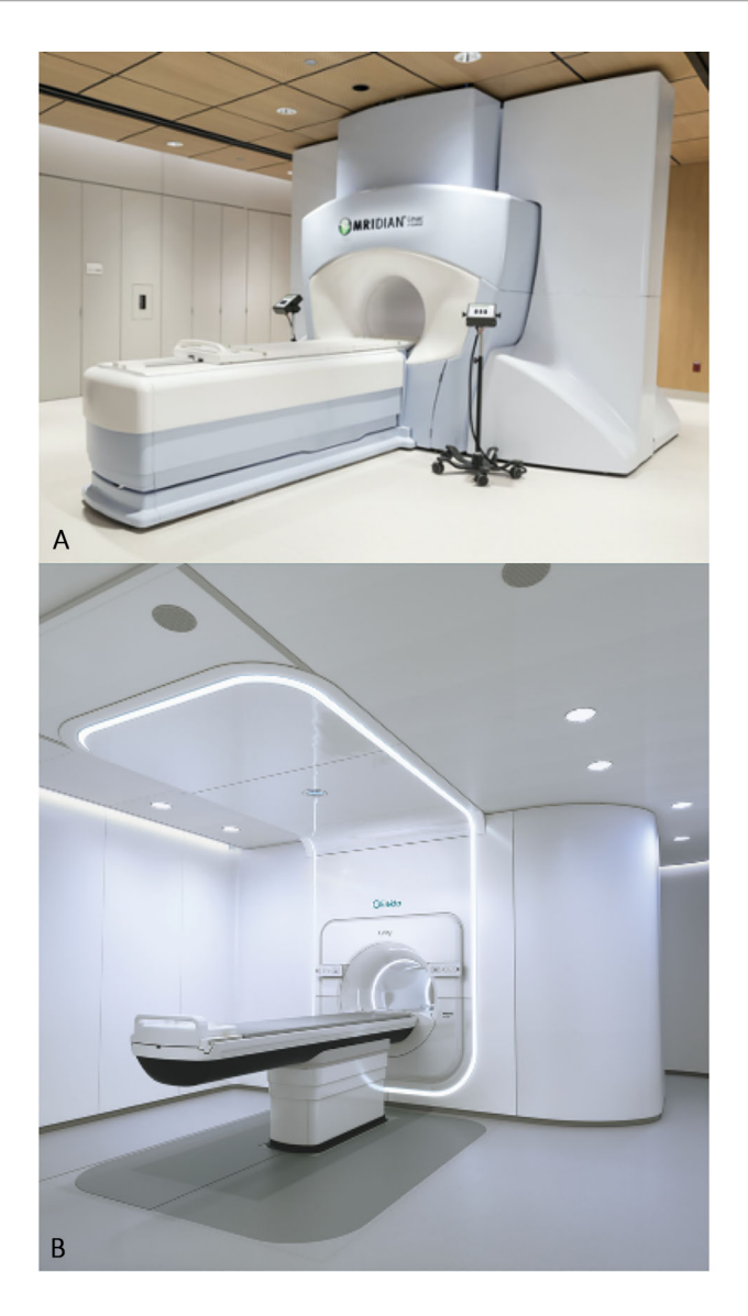
FIGURE 2 | The two commercially available MR-guided radiotherapy systems. (A) The MRIdian (ViewRay Inc, USA). (B) The Unity (Elekta, Sweden).

Unity (Elekta, Sweden) systems, and their use in the lung cancer setting ( Figure 2 ).