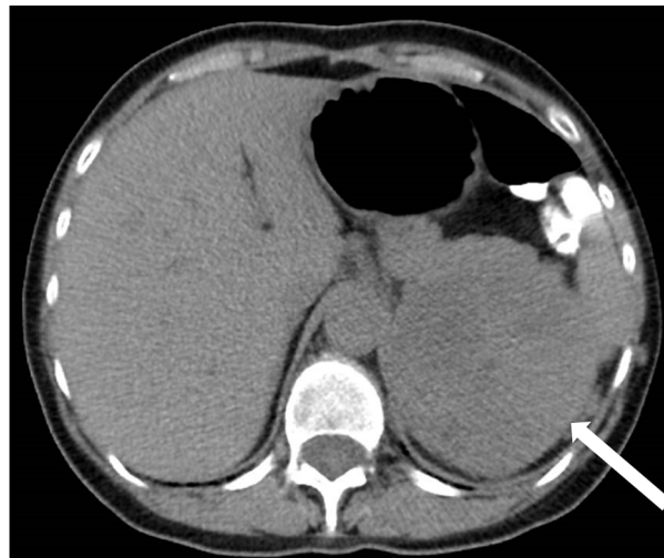
FIGURE 1 | Left adrenal tumour, 9.5 cm in its largest diameter. Unenhanced computed tomographic scan. Native density 40 Hounsfield unit.

A 64-year-old woman was referred to our adrenocortical cancer referral centre following left adrenalectomy. The adrenal tumour, 9.5 cm in its largest diameter, was detected incidentally during investigations for an unexplained rash ( Figure 1 ). Preoperative hormonal measurements including plasma cortisol, aldosterone, ACTH, and plasma renin activity resulted in the diagnosis of a non-functional adrenal tumour. Chest and abdominal computed tomography revealed discrete peritumoral adipose tissue infiltration without pathological lymph nodes or distant metastases. The native density of the tumour on CT was +40 Hounsfield unit. Histological examination showed vascular invasion, Ki67 of 10% and a mitotic count of 3/10 high-power field. Immunohistochemistry revealed p53 positivity. Pathological TNM grade was reported as T2N0M0, ENSAT stage 2.