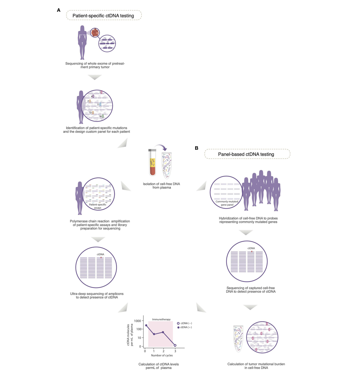
FIGURE 2 | Detection of circulating tumor DNA (ctDNA) in plasma. (A) A customized panel containing multiplexed assays is designed to detect patient-specific mutations in cell-free DNA. The personalized panel is created from a list of mutations detected from whole exome sequencing of the untreated primary tumor. Matched germline DNA is also sequenced to exclude non-somatic mutations due to clonal hematopoiesis of indeterminate potential. Amplicons produced by polymerase chain reaction amplification of genomic regions that contain the selected mutations are subjected to ultra-deep sequencing to detect the presence of ctDNA. (B) In a panel-based approach, cell-free DNA is hybridized to probes that represent a panel of frequently mutated genes (e.g., PlK3CA and TP53 ), and therefore, the mutational profile of the corresponding solid tumor is not required for testing. The captured cell-free DNA molecules are then subjected to next generation sequencing to detect the presence of ctDNA. Because the panel of genes used for testing is consistent across all samples, and includes highly mutated genes, the tumor mutational burden in cell-free DNA can be calculated. In both approaches for testing of ctDNA, serial plasma can be prospectively collected to monitor the levels of ctDNA as a potential biomarker of response to immunotherapy [Modified with permissions from (10)].