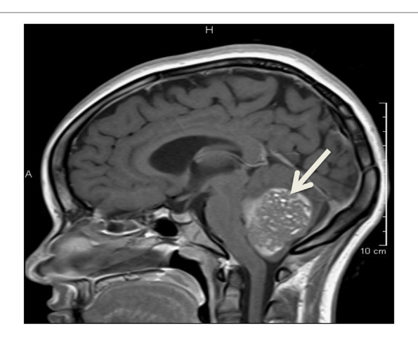
FIGURE 2 | Large fourth ventricle mass consistent with medulloblastoma.