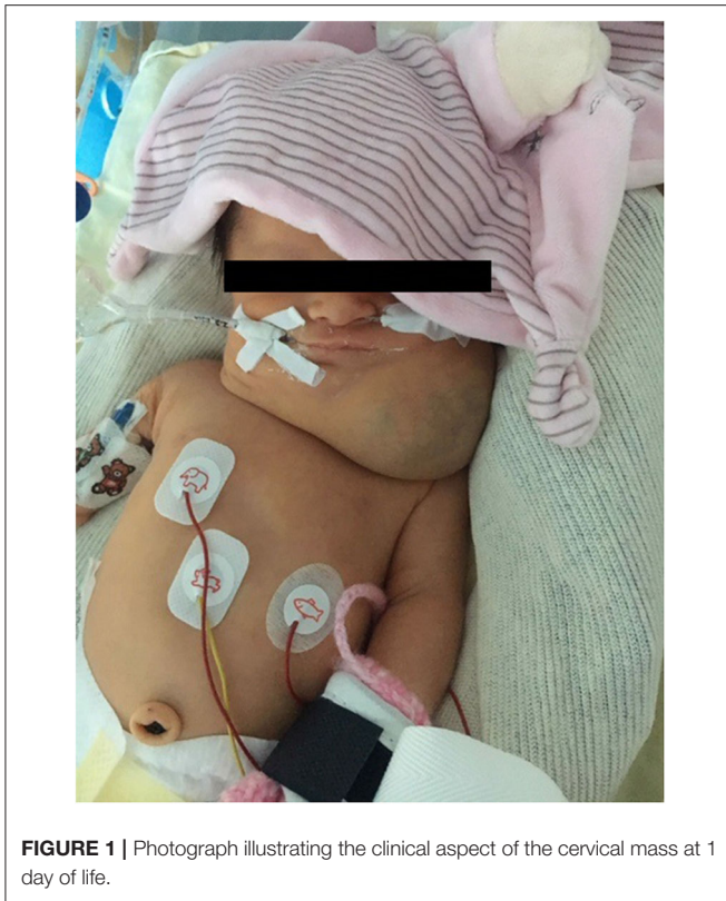
FIGURE 1 | Photograph illustrating the clinical aspect of the cervical mass at 1 day of life.

cystic lymphatic malformation. Fetal MRI (Magnetic Resonance Imaging) examination showed a cystic lymphatic malformation located in the left cervical and laryngeal region and surrounding the trachea. No malformation was diagnosed in her twin sister.