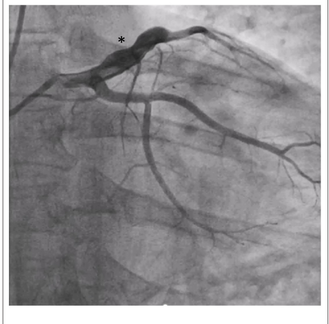
FIGURE 1 | Proximal ectasia (*) revealed by angiography.

diagnosis of AD HIES are described in a Taiwanese cohort. One death occurred due to acute myocardial infarction with dilated coronary artery in a 13 year old male (20). Additional case reports describe symptomatic aortic and cerebral aneurysms in pediatric (21, 22) and adults but with limited genetic and follow-up information. Subsequent cross-sectional studies within genetically-defined STAT3-HIES US (National Institute for Health) and French cohorts have provided convincing evidence for widespread "vasculopathy" in STAT3-HIES. In 59 patients imaged from infancy to adulthood (8 to 57 years), intracranial