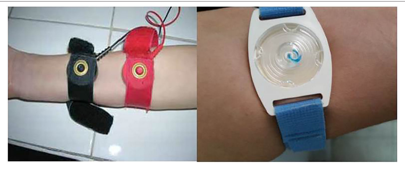
FIGURE 2 | Iontopheresis and sweat collection by Macroduct System.

long it flows for in order to determine how many free Cl<sup>-</sup> ions are in the solution at the beginning of the process. Using a specimen volume of \geq 15 µL, a chloridometer can measure Cl<sup>-</sup> concentrations from 10 to 160 mmol/L (4).