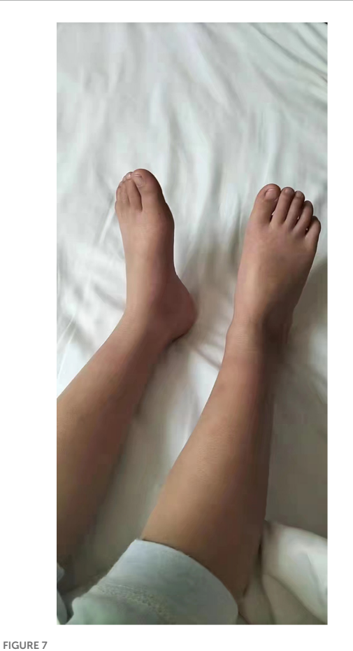
Follow-up of the patient out of hospital -1year later.

fatal hypothermic necrosis. As this case demonstrates, an 8-year-old boy claimed abnormal paresthesia in feet and ankles with burning sensation and pain for 2 years. The main symptoms had been aggravated during the 6-months prior to seeking care at Sun Yat-sen Memorial Hospital. The skin of both lower legs was redness and underwent ichthyosis and lichenification. The blood pressure was within normal range. The patient had no history of taking special drugs. Laboratory tests excluded autoimmune diseases and hematological malignancies. Therefore, the patient was clinically diagnosed with PEM.