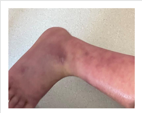
FIGURE 4 Post-discharge skin changes in children.