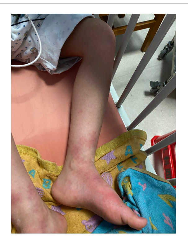
FIGURE 5 Follow-up of the patient out of hospital -3months later.

Min) to control the blood pressure at 110/86 mmHg (NHBPEP 90th), to improve skin injury and color of both lower limbs. The patient was discharged after his blood pressure stabilized. The patient was discharged after his blood pressure stabilized and the skin damage was relieved ( Figure 4 ). After discharge from the hospital, the subject was followed-up for 1-year, and showed recovery of the skin to normal ( Figures 5–7 ).