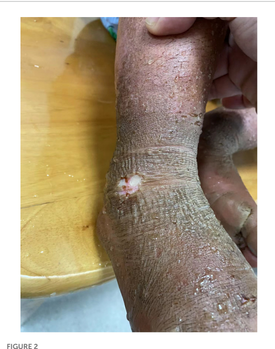
Two ulcer lesions were observed on the skin of the right ankle.

The skin of both soles and heels and between the toes was chapped and ulcerated to form frostbite-like skin lesions.