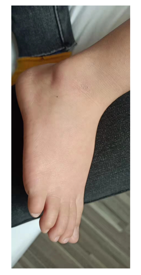
FIGURE 6 Follow-up of the patient out of hospital -6months later.

Min) to control the blood pressure at 110/86 mmHg (NHBPEP 90th), to improve skin injury and color of both lower limbs. The patient was discharged after his blood pressure stabilized. The patient was discharged after his blood pressure stabilized and the skin damage was relieved ( Figure 4 ). After discharge from the hospital, the subject was followed-up for 1-year, and showed recovery of the skin to normal ( Figures 5–7 ).