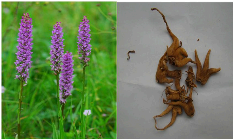
FIGURE 1 | Photographs of Gymnadenia conopsea (L.) R. Br. and the tuber.

been used as substitutes for G. conopsea in certain regions, such as Tibet region (Xie et al., 2005; Zi, 2008; Xue et al., 2009).