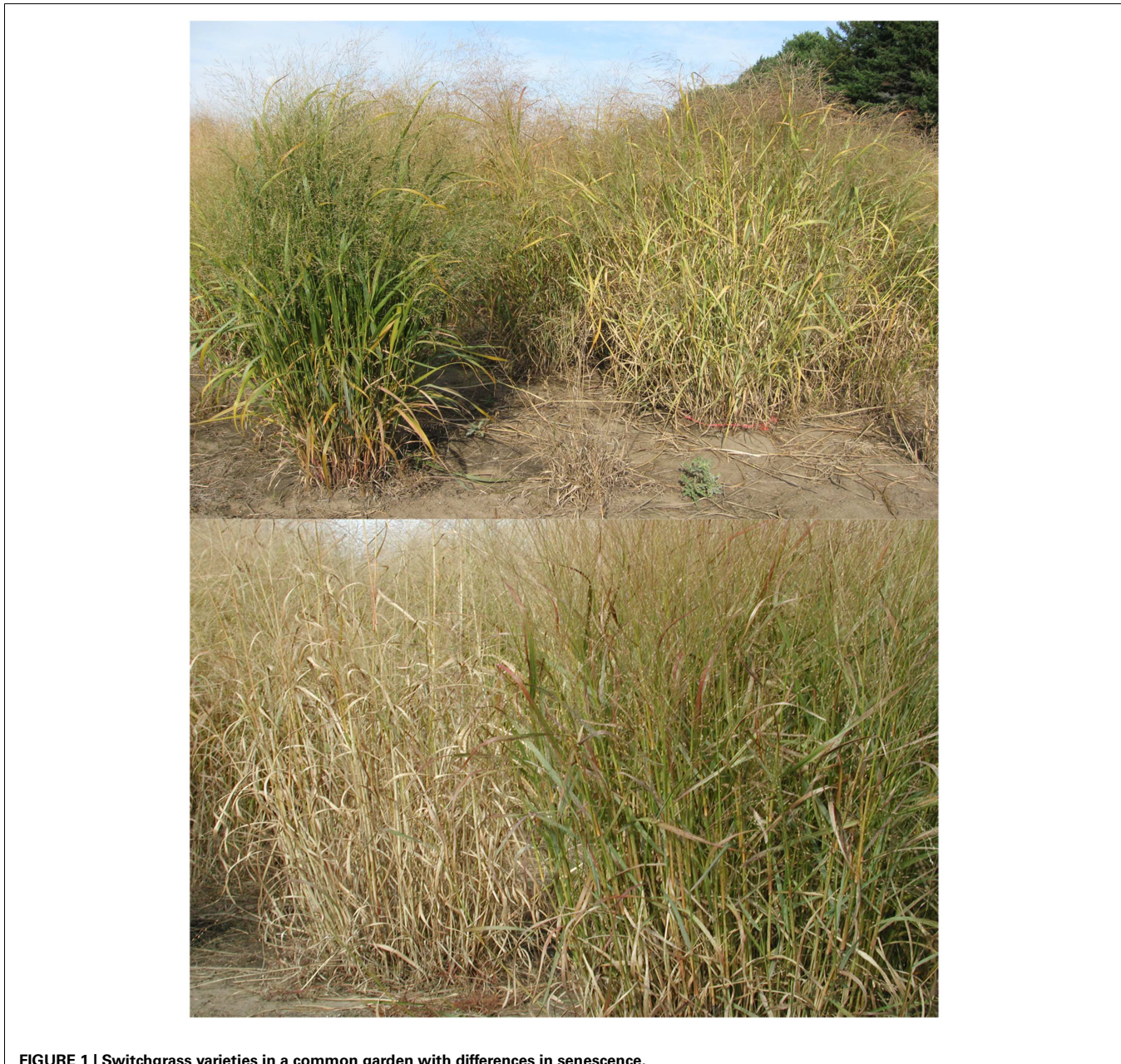
FIGURE 1 | Switchgrass varieties in a common garden with differences in senescence.

northern cultivar, showed the largest response to an artificially extended photoperiod (18 h) in a greenhouse with an increased yield of 129 and 98% in two trials, while Alamo showed no change (Van Esbroeck et al., 2003). In general in common garden experiments, lowland ecotypes have a heading date 2-4 weeks later than upland types (Casler et al., 2004; Cortese et al., 2010). In work from Taliaferro (2002), heading date was recorded for 113 switchgrass germplasms with variable flowering time [167-257 Days Of Year (DOY) (Taliaferro, 2002)]. Grouping accessions according to cytotype and ploidy generates three significantly different groups (Lowland4 \times , Upland4 \times , Upland8 \times ) when evaluating heading data (P = 0.0002), however, most variation is within each class