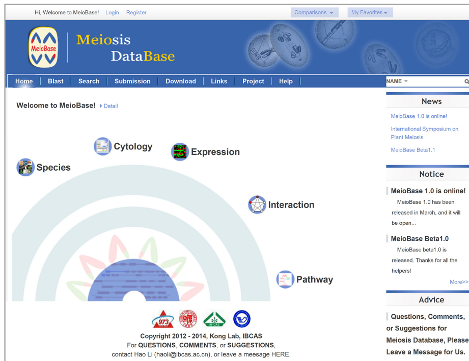
FIGURE 1 | Screenshot of MeioBase homepage.

Here, by collecting and integrating all sorts of information related to meiosis, as well as including and developing powerful tools for search, comparison and analysis, we established a comprehensive and specialized database for meiosis, MeioBase. It will not only serve the meiosis research community, but also help any users who need an easy and efficient access to various kinds of information related to meiosis.