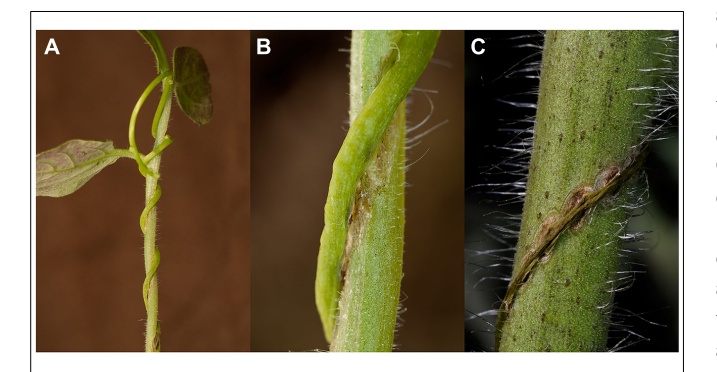
FIGURE 2 | Cuscuta reflexa on its resistant host plant Solanum lycopersicum (cultivated tomato). (A) C. reflexa ~7 days after initial contact to the tomato shoot. (B) Enlarged detail of (A) shows the secondarily modified tissue of tomato at the penetration sites next to the parasitic haustoria. (C) C. reflexa dies off ~14 days after initial contact with tomato; the secondarily modified tissue of tomato reminds of a kind of 'hypersensitive response' (HR).

Is this resistance to Cuscuta due only to a wound response? This is called into doubt by the observation that these wound symptoms, and induction of the two stress hormones SA and JA, also occur in the tomato after interaction with Cuscuta pentagona , which can successfully infect this host. C. pentagona , however, induces visible HR symptoms in tomato as well and can grow better on transgenic tomato plants expressing a gene for a salicy-late hydroxylase ( nahG ). In these nahG plants, the HR symptoms