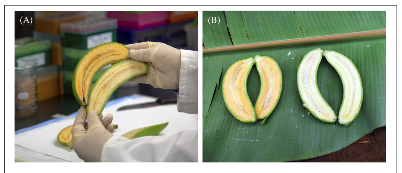
FIGURE 2 | (A) PVA-biofortified "Cavendish" banana in Australia and (B) PVA-biofortified (left) and wild-type control (right) "Nakitembe" EAHB in Uganda.

At the completion of Phase 2, proof-of-concept for PVA biofortification had been demonstrated in Australia using "Cavendish" and "Lady Finger" bananas and revealed that target fruit PVA levels could be achieved using the constitutive (Ubi) or fruit-specific (Aco) expression of MtPsy2a alone (Paul et al., 2017). Further, very few off-type traits, such as reduced yield and increased cycle time, were observed in the transgenic lines and the trait appeared stable over successive generations. Importantly, the field trial in Uganda (UFT-1) produced multiple lines with fruit PVA levels higher than their respective controls including one Exp1- MtPsy2a line of M9 with 33.1 \mu g/g dw \beta -CE (Mbabazi, 2015). With this knowledge, a new generation of plant expression vectors were made at QUT and two constructs containing Ubi- MtPsy2a and Aco- MtPsy2a