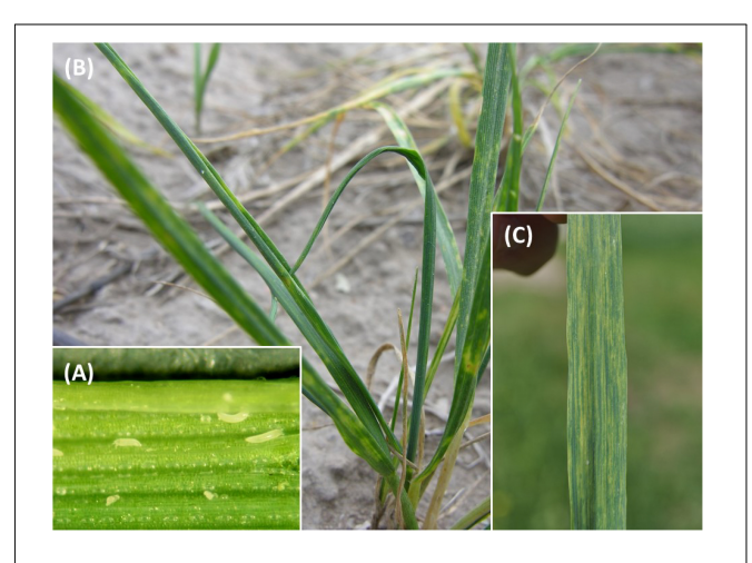
FIGURE 2 | Wheat curl mite (WCM) and WSMV symptoms: (A) specimens of WCM on a wheat leaf; (B) leaf curls caused by WCM; and (C) WSMV symptoms on wheat leaf.