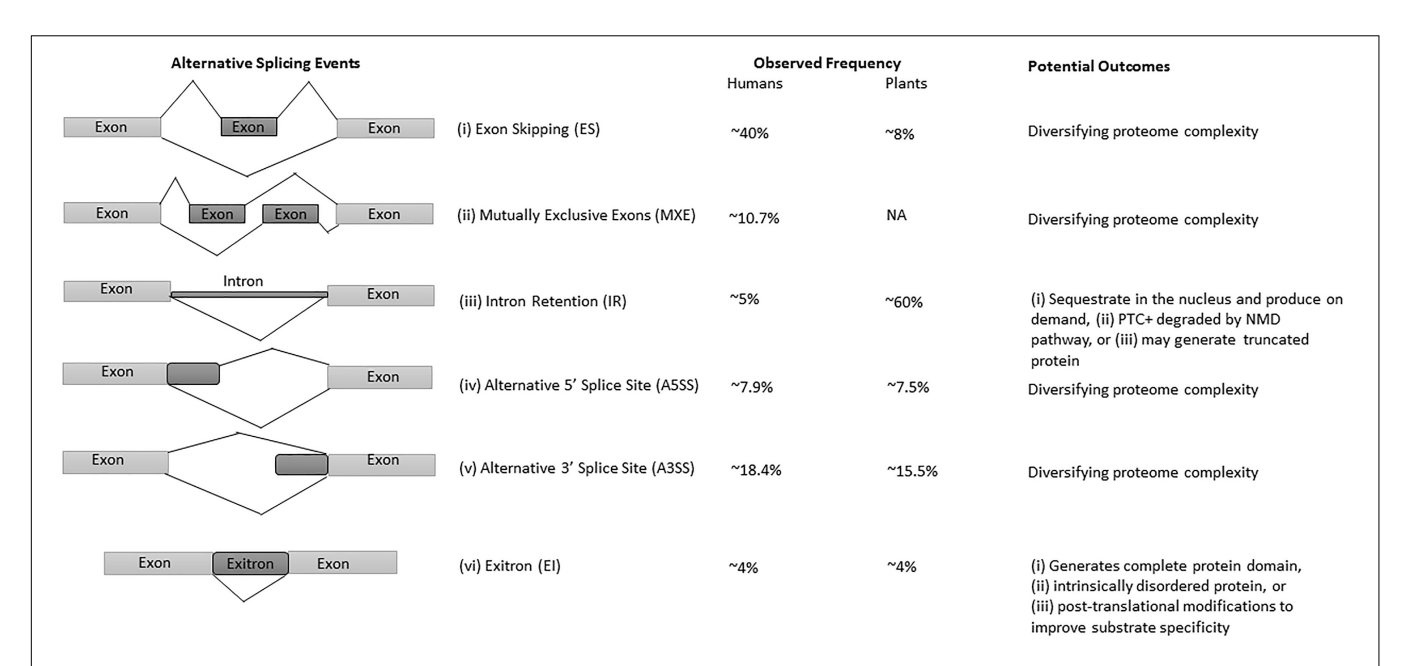
FIGURE 1 | Major types of AS events, their frequency, and potential outcomes in humans and plants. (i) exon skipping (ES) or cassette exon, in which single or multiple exons are spliced out or retained; (ii) mutually exclusive exons (MXE), in which only one of the two exons is retained; (iii) intron retention (IR), where an intron remains in the mature transcript; (iv, v) alternative donor/acceptor site or 5'/3' splice junction is used to alter the boundary of exons, and (vi) exitrons are a variety of IR with some feature of exons. Constitutive and alternatively spliced exons are represented as light and dark gray blocks, respectively. The observed frequencies represented here are approximate values, and may differ in different species, tissues and conditions. The presented data on AS events frequency are from Reddy et al. (2013), Marquez et al. (2015).

animals and examples from plants are beginning to emerge as well. CircRNAs could make DNA:RNA hybrids with the genomic DNA to generate the so-called R-loop. Indeed, a circRNA derived from exon 6 of the SEPALLATA3 ( SEP3 ) gene forms an R-loop via direct interaction with the SEP3 locus (Conn et al., 2017). The R-loop formation around exon 6 of the SEP3 gene results in skipping of this exon and affects petal and stamen number in Arabidopsis (Conn et al., 2017).