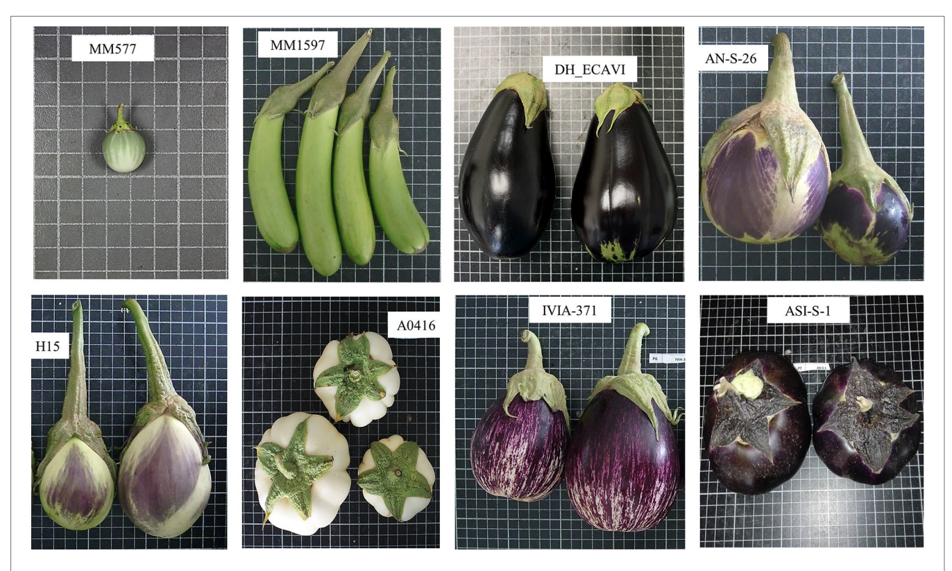
FIGURE 1 | Pictures of the seven Solanum melongena and one S. incanum (MM577) accessions resequenced in this study. Fruits are not depicted at the same scale; the size of the grid cells is 1 cm × 1 cm.

<sup>e</sup>The fruit skin does not contain anthocyanins, and therefore, the PUC allele presence is unknown.