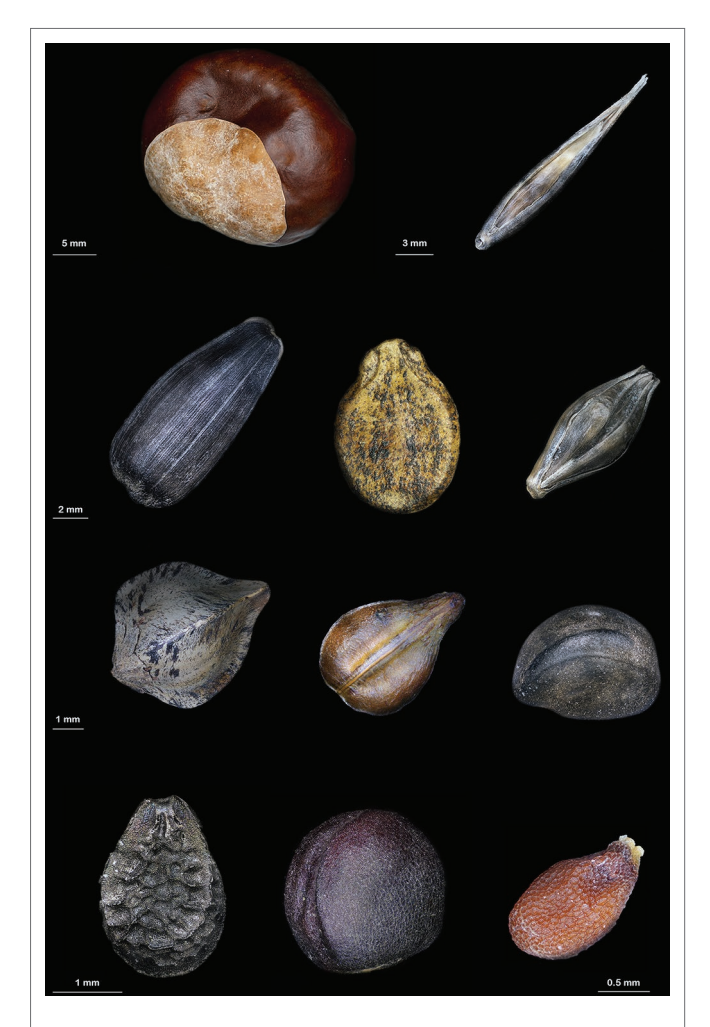
FIGURE 1 | Some plant species accumulate melanins in seeds; the presence of melanins was confirmed by physicochemical methods. First row (from left to right): chestnut ( Castanea mollissima ) and oat ( Avena sativa ), second row: sunflower ( Helianthus annuus ), watermelon ( Citrullus lanatus ), and barley ( Hordeum vulgare ), third row: buckwheat ( Fagopyrum esculentum ), grape ( Vitis vinifera ), and ipomoea ( Ipomoea purpurea ), fourth row: sesame ( Sesamum indicum ), rape ( Brassica napus ), and black mustard ( Brassica nigra ).

In addition to chemical tests, spectroscopic techniques have been applied to confirm the melanic nature of pigments. UV-Vis spectroscopy is the most broadly used to identify and quantify melanins. Melanins of different origin are characterized by high absorbance in visible and ultraviolet spectrum with the maximum at 196–300 nm (Lyakh, 1981; Pralea et al., 2019). To identify the major functional groups in the melanin macromolecules, Fourier transform infrared (FT-IR) spectroscopy has been used. The typical FT-IR spectra of melanin include characteristic bands for phenolic fragments, quinone, aliphatic hydrocarbon groups, and an aromatic carbon