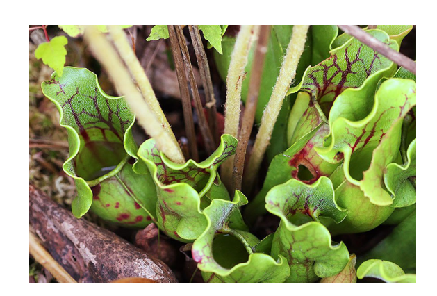
FIGURE 2 | The carnivorous purple pitcher plant, Sarracenia purpurea, a folk remedy by the Native Americans to treat smallpox. The image shows the "pitchers" which are traps to little invertebrates. Image taken at the John Bryan State Park (Ohio, USA).