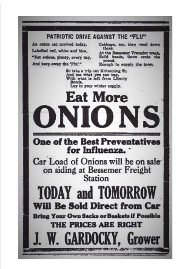
FIGURE 4 | Propaganda poster that got popular during the 1918 flu pandemic in the USA.

control by the release of annual vaccination campaigns with newly synthesized vaccines that collect most of the virus' seasonal variability. In the latter most important flu pandemic (2009) besides the vaccine, oseltamivir (Tamiflu®) a drug derived from the species Ilicium verum (star anise, from family Schisandraceae) was also crucial to treat most severe cases, although the production of this compound is limited by the low productivity of the tree, and synthetic derivatives are being developed (Macip, 2020). Finding adequate treatments for flu is still and urgent task as the fear of a pandemic similar to the one in 1918 is a still a sword of Damocles in the concerns of most epidemiologists.