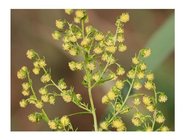
FIGURE 3 | Synflorescences of the sweet wormwood, Artemisia annua .

contributing to a better health and saving tens of thousands of lives every year in tropical developing countries of South Asia, South America and Africa.