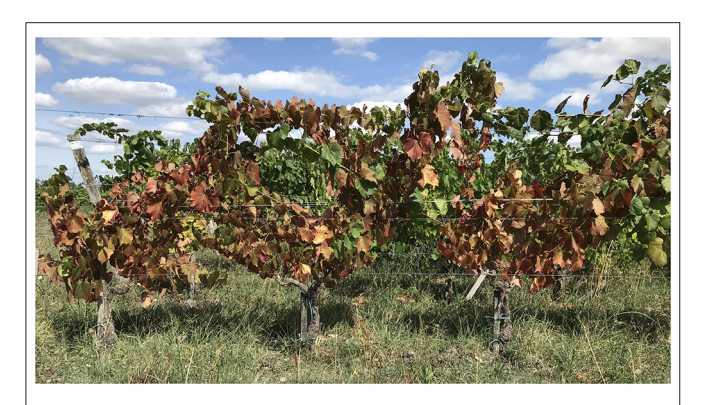
FIGURE 3 | Photograph of grafted grapevines showing symptoms of graft incompatibility 10 years after grafting.

growing season than the other compatible combinations, which is also indicative of accumulation of carbon in the scion ( Figure 3 ). However, these observations were not found in a study of four varieties of pear grafted onto two rootstocks (compatible and incompatible) (Ciobotari et al., 2010) and in citrus chip-budded trees (Mendel and Cohen, 1967).