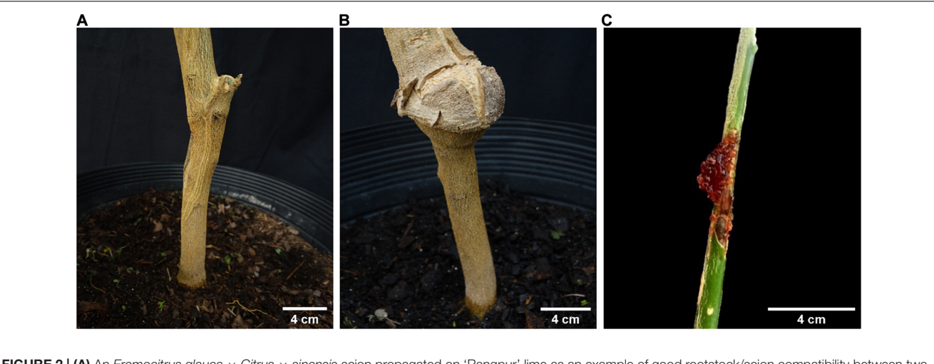
FIGURE 2 | (A) An Eremocitrus glauca × Citrus × sinensis scion propagated on 'Rangpur' lime as an example of good rootstock/scion compatibility between two genotypes. (B) Limonia acidissima scion propagated on 'Rangpur' lime showing overgrowth incompatibility at the graft union. (C) Profuse gum exudation in the graft union between 'Valencia' sweet orange budwood and Citrus halimii scion.

Las host as 'Rangpur' lime even under controlled experimental conditions and forced challenge-inoculations, and therefore how important is to use proper controls of infection to avoid getting false negatives when testing genotypes for resistance to this bacterium.