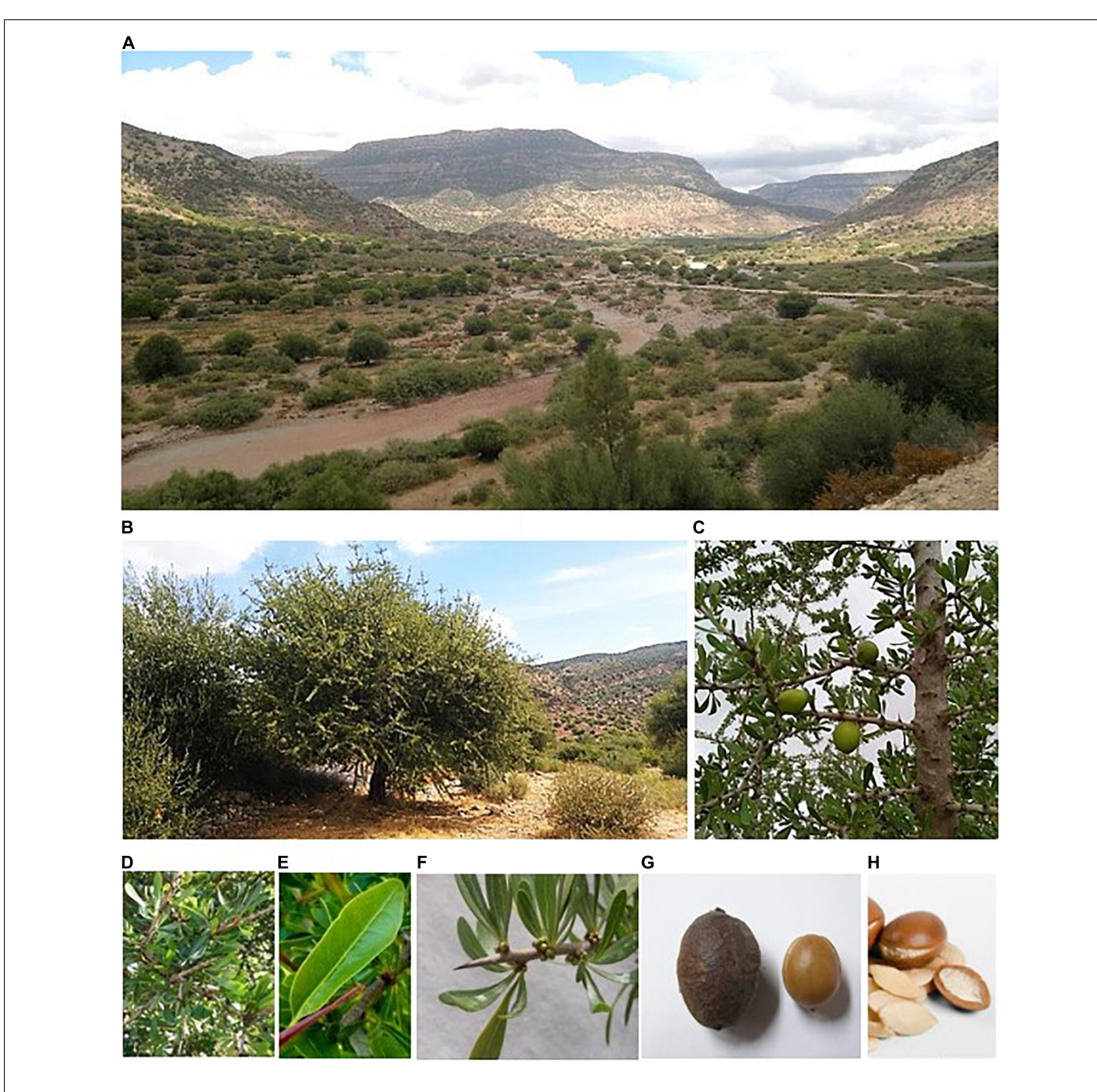
FIGURE 1 | Different aspects and parts of Argania spinosa (A) argan forest, (B) adult argan tree, (C) argan branch bearing immature fruits, (D,E) argan leaves, (F) argan nodal stem, (G) fruit and seed of argan tree, and (H) argan nuts.

fruits of the argan tree exhibit various phenotypes (Bani-Aameur et al., 1999; Bani-Aameur and Ferradous, 2001; Ait Aabd et al., 2011, 2012; Zhar et al., 2016), being false drupes (according to Rammal et al., 2009) of size ranging from olive to walnut with different morphotypes (oval, rounded, and fusiform). The fruit of A. spinosa is very special; there is a hard stone (seed) under the fleshy pulp with 2–3 (or even 4 or 5) cavities containing false almonds (nuts). At maturity, the fruit color evolves toward yellow or red. Some argan trees produce fruit every year, others every other year, and others with a 3-year periodicity. There may be one to three seeds per fruit, often only one, the others having aborted.