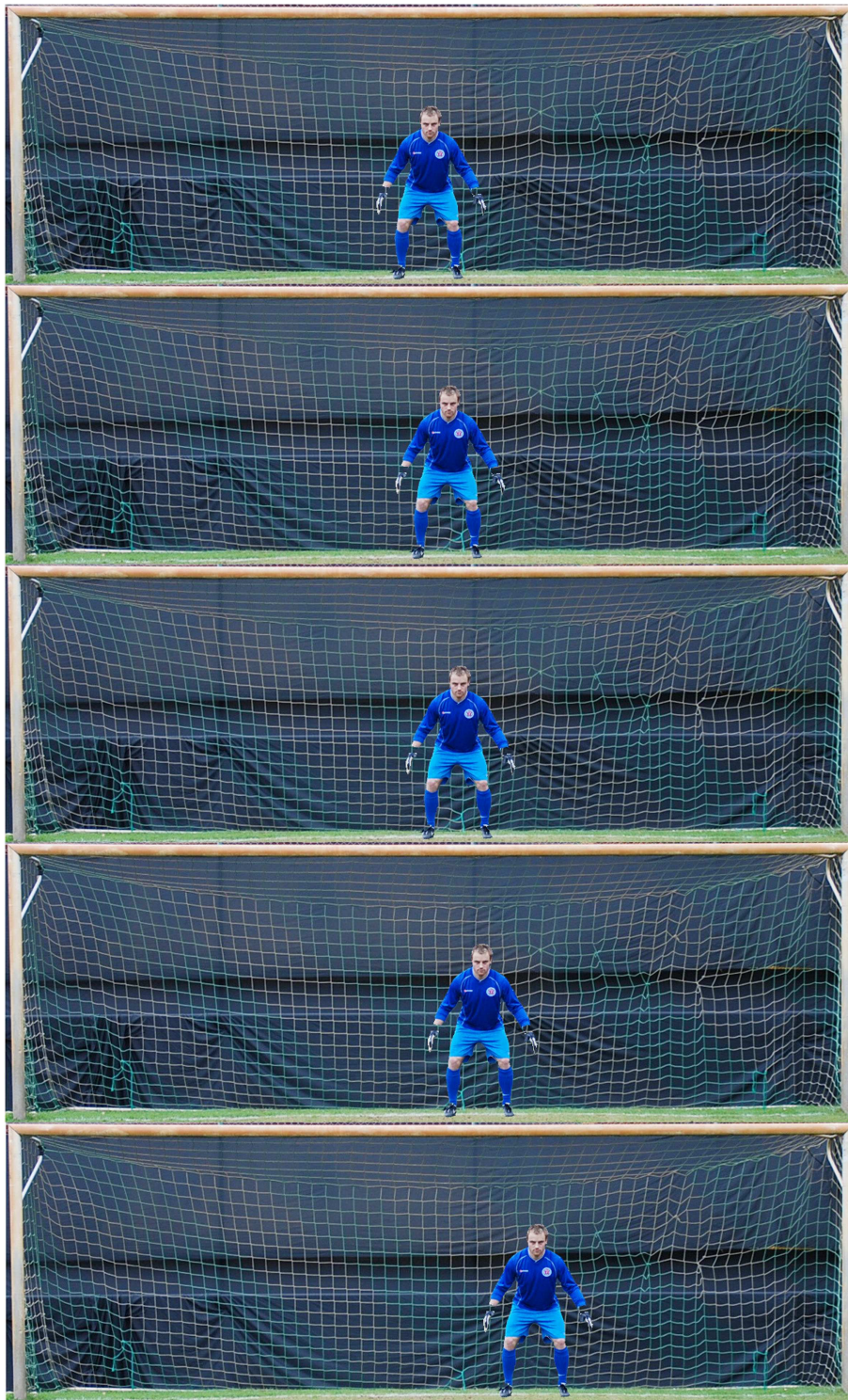
FIGURE 1 | Depicted are five of nine stimulus displays used in the present study. The goal keeper was shown in a neutral goalkeeping posture, either in the goal's center or in one of four displacements to the left (not displayed here) or right of center.

Thus, the instruction regarding the perception task was different to the instruction in the action selection task. The perception task was included in order to learn more about conscious and