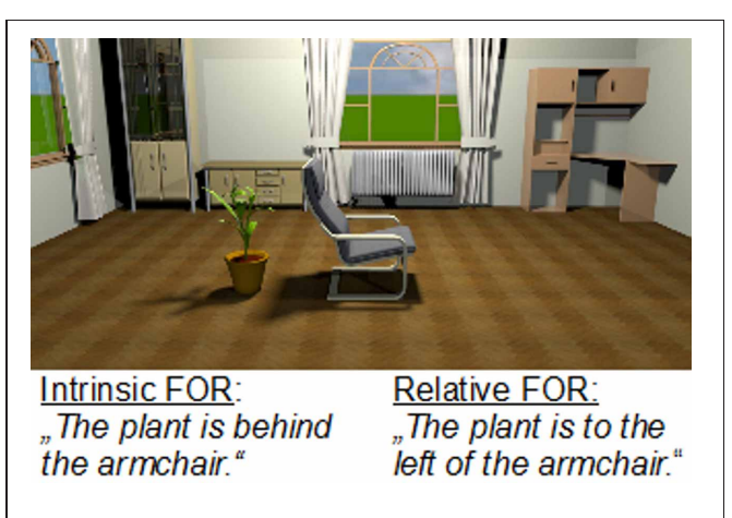
FIGURE 1 | Scene with background and both FOR.

version, the object configurations were shown in front of a white background ( Figure 2 ). This version ( ersatz scene , Henderson and Ferreira, 2004) will be referred to here as "scene without background." Participants saw either the version with or the version without background, therefore there were equal number of scenes with and without background. The size of the scene