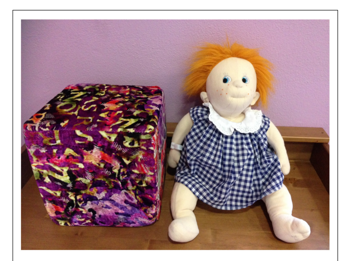
FIGURE 1 | A doll and the soft foam rubber cube used during the experimental sessions.

The experimental protocol consisted of 10 non-consecutive sessions that were conducted over 30 days. The procedure about the interaction between the nurse and the patient and the presentation of the object (the doll or the cube) was the following: when the nurse accompanied the patient in the room and the patient took a seat, the nurse went out and come back with the doll or the cube. The nurse put the doll or the cube in front of the patient and said "Good morning Mr./Mrs.... look." The nurse gazed at the patient. The tone of voice was quiet. The doll or the cube was showed in the same way: they were hold with both arms in front of the patient and far away from the body. If the patient did not take the doll or the cube at the first attempt, s/he was invited to a second command "Take it" and after waiting a few seconds "Is for you". If the patient did not take the object after the second request, the nurse did not insist, she went away and said: "I have to go, goodbye Mr./Mrs. . . . . " If the object was taken, the nurse did not make any comment and did not interact with the patient but she went away from the patient and said "I have to go, goodbye