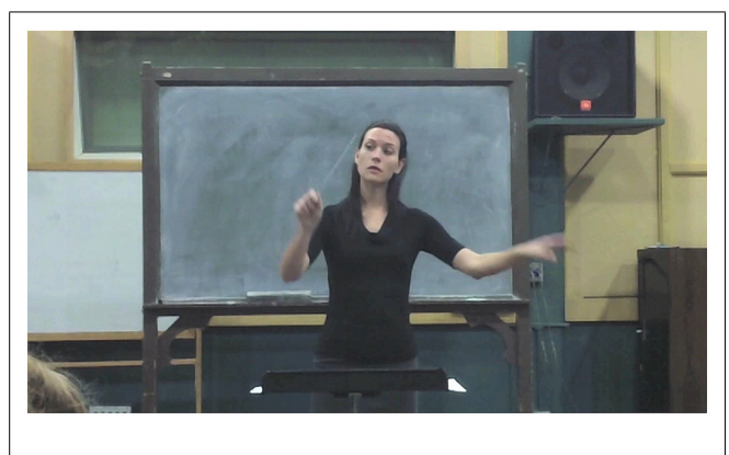
FIGURE 2 | Screenshot of conductor video.

equivalent 16-item test forms, each including two items from each condition. Presentation order was randomized with the stipulation that neither the same conductor nor the same music excerpt would appear successively. To allow time for participants to respond, the audio/video segments were interspersed with a screen displaying "Please Respond" for 8 s. Using iDVD (Apple Inc.), we burned each order onto a separate DVD.