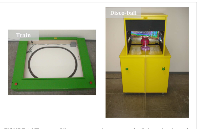
FIGURE 1 | The two different types of apparatus (collaboration boxes) used for the problem-solving task in Phase 2 (left: train box , right: disco-ball box ).

In Phase 3, two additional boxes were uncovered. These two new boxes were identical to the first box; the only difference being that children could activate the toys inside the boxes individually ( individual play boxes ). The individual train boxes had red buttons mounted closer together allowing children to activate the train individually. The individual disco-ball boxes had no Plexiglas divider preventing children from triggering the disco ball inside individually. The general setup of Phase 2 and Phase 3 is also illustrated in Figure 2 .