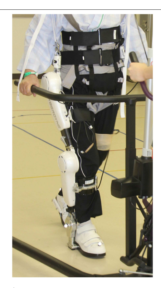
FIGURE 2 | Patient wearing HAL in a walking device (front view).

For the purpose of illustrating SA, we will present the exoskeleton robot HAL (hybrid assistive limb) (Sankai, 2006, Sankai, 2011) which is used for gait rehabilitation of spinal cord injury and stroke patients who suffer from severe impairments of motion (cf. Figures 2 , 3). Currently HAL supports straightforward walking, standing up and sitting down. As different clinical studies show, HAL has successfully supported rehabilitation of 16 stroke patients (Kawamoto et al., 2013), 32 patients with stroke, SCI, muscoskeletal and other diseases (Kubota