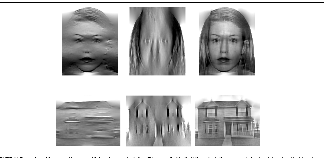
FIGURE 1 | Examples of faces and houses with bandpass orientation filters applied to limit the orientation energy to horizontal and vertical bands, as well as a combination of both orientation passbands.

contrast across all images. We note that these latter manipulation do not guarantee that all low-level properties of the stimulus images are matched (local contrast may vary across images and categories, for example, when pixel intensity values are matched), but nonetheless ensure that some global image properties are closely controlled.