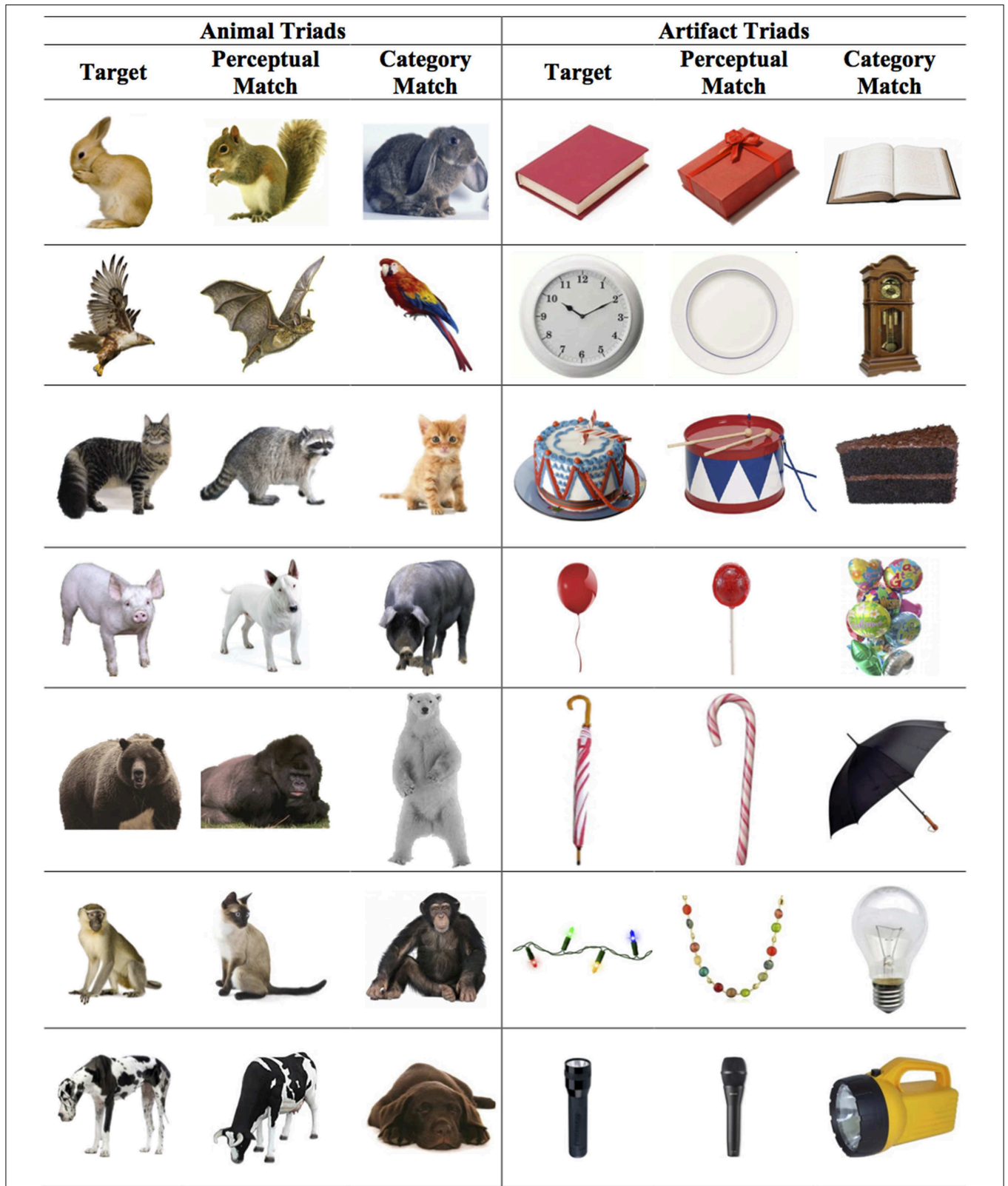
FIGURE 1 | Visual stimuli used in the Property Induction Task. No labels were presented during the task. Each triad included a target, a category-match test item, and a perceptual-match test item. During

the experiment, the target items were presented in the middle of the screen above the test items and approximately equidistant from each test item.