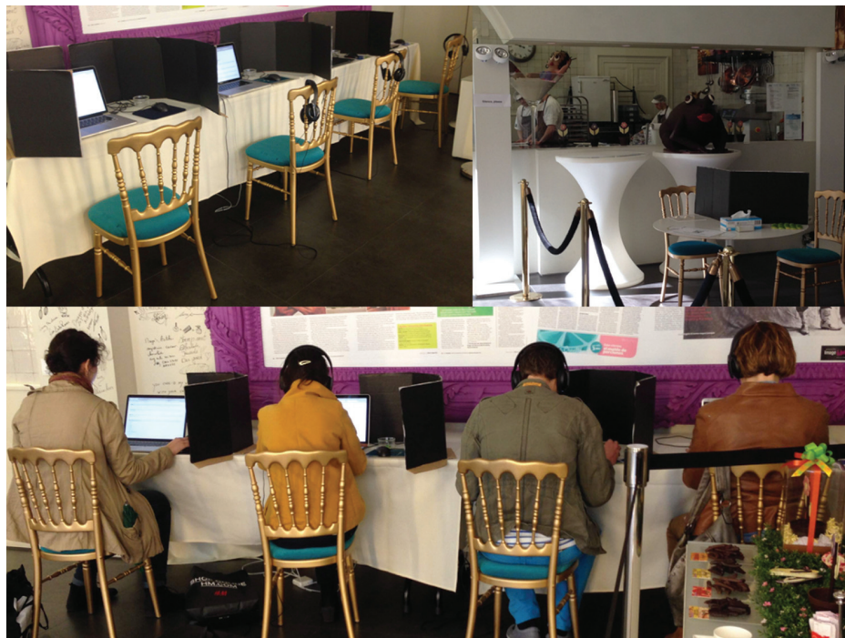
FIGURE 3 | Experimental booths prior to the experiment (top left), overview of the kitchen when entering the experimental area (top right) and overview of the experimental booths during the experiment (bottom).