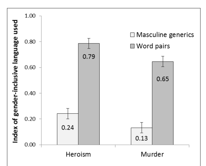
FIGURE 1 | Index of gender-inclusive language (word pairs, neutralizing words) used in the summaries by text topic (heroism vs. murder) and linguistic forms in the text (masculine generics vs. word pairs). Error bars represent standard errors of the mean.

SD = 0.42) than about murders (M = 0.39, SD = 0.42), F(1,259) = 9.53, p = 0.002, \eta_p^2 = 0.04 . The interaction of social role and linguistic form was not significant, F < 1.