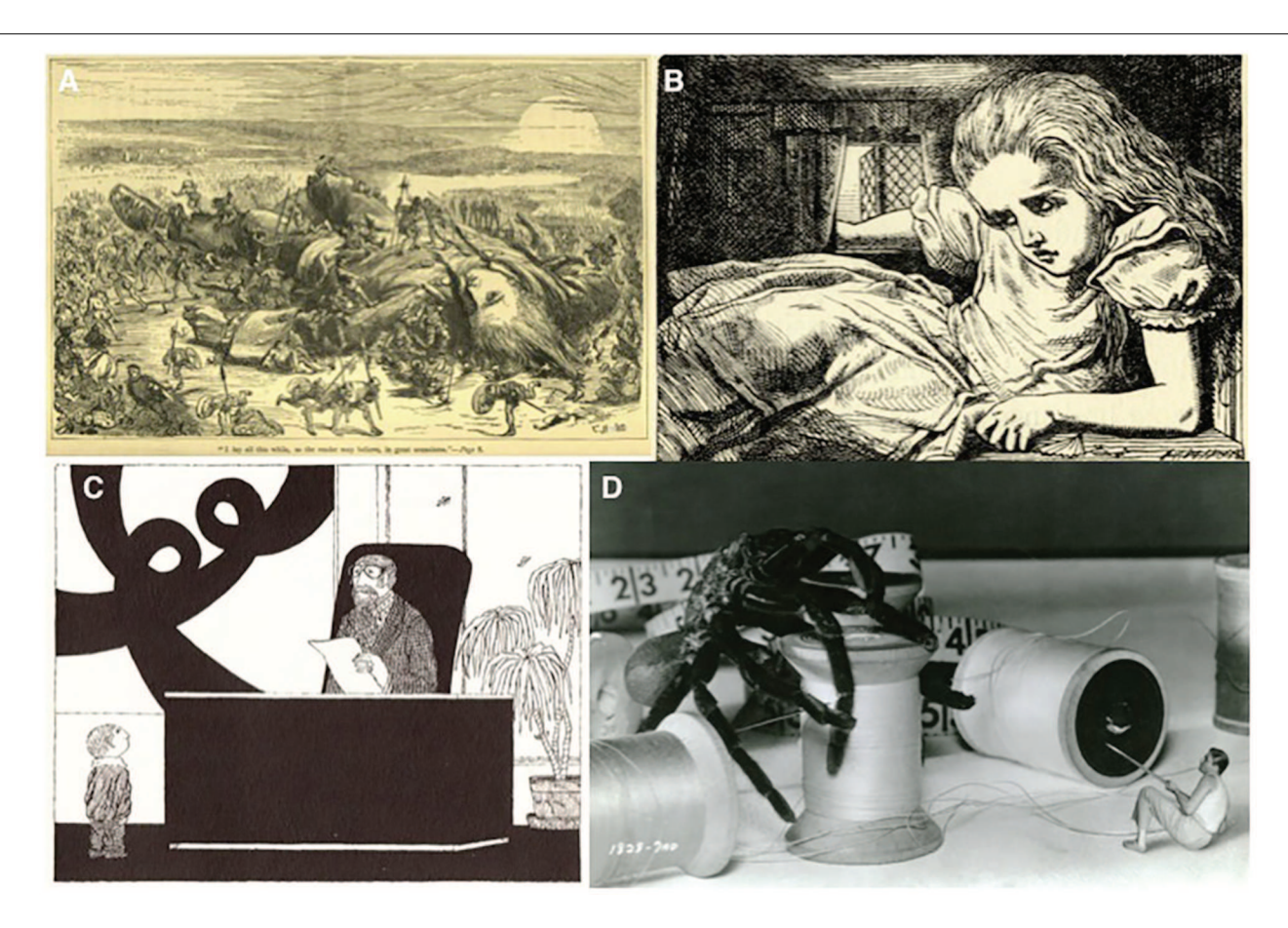
FIGURE 1 | Examples of the Gulliver theme in fiction, spanning political satire, children's tales, and science-fiction/horror. (A) The iconic discovery of the Lilliput people in Swift's Gulliver's Travels (illustration: Thomas Morten, 1865). (B) Alice's fourth scale alteration in Alice's Adventures in Wonderland (illustration by John Tenniel, 1866). (C) In The Shrinking of Treehorn by Florence Parry Heide (1971; illustration: Edward Gorey), the progressive shrinking of a child protagonist illustrates feelings of insignificance and the scaling disparity that separates the adult and child worlds. (D) In The Incredible Shrinking Man (Jack Arnold, 1957), adapted from Richard Matheson's The Shrinking Man , the protagonist fights for his life using commonplace items as weapons.