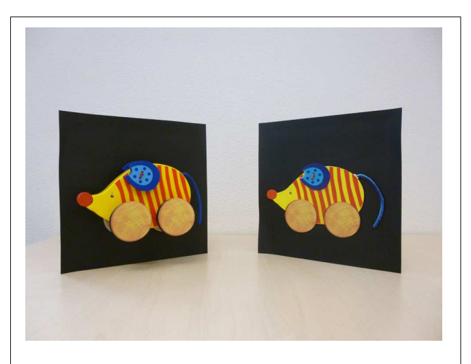
FIGURE 1 | Example of a stimulus pair. Stimuli a slightly tilted inward to get a better view on the real object (left hand side) and its matched photograph (right hand side).

During testing, one experimenter measured infants' fixation times while a second experimenter presented the stimuli. Both