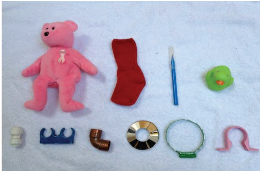
FIGURE 1 | Exposure Array and Comprehension Test Array. From top, left to right: pink teddy, red sock, blue pen, green duck, white connector, blue double pipe clip, copper elbow, chrome pipe collar, green hose clip and pink pipe clip.