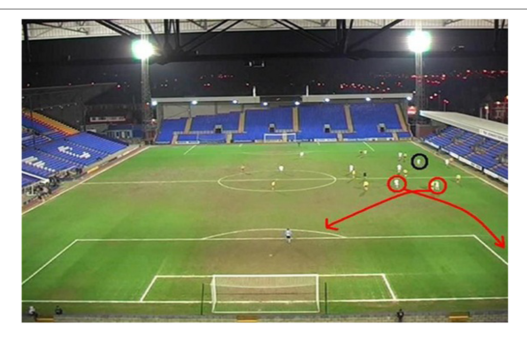
FIGURE 3 | An example of a freeze-frame from the visual attention intervention which highlights ball location and the position and subsequent movement of the two central attacking players.

black circle, participants in this group were cued as to the most important players and where they should direct their attention using red circles (to highlight the players) and red arrows (to highlight their movements). The visual cues to guide attention were all presented during the freeze-frame only so as to avoid potentially obstructing information once clips played normally. To ensure consistency, the same players were highlighted as in the verbal instruction group and each clip was played for the same length of time with the same number of freeze-frames inserted for the same length of time. An example of a freeze-frame from the visual guidance group is shown in Figure 3 .