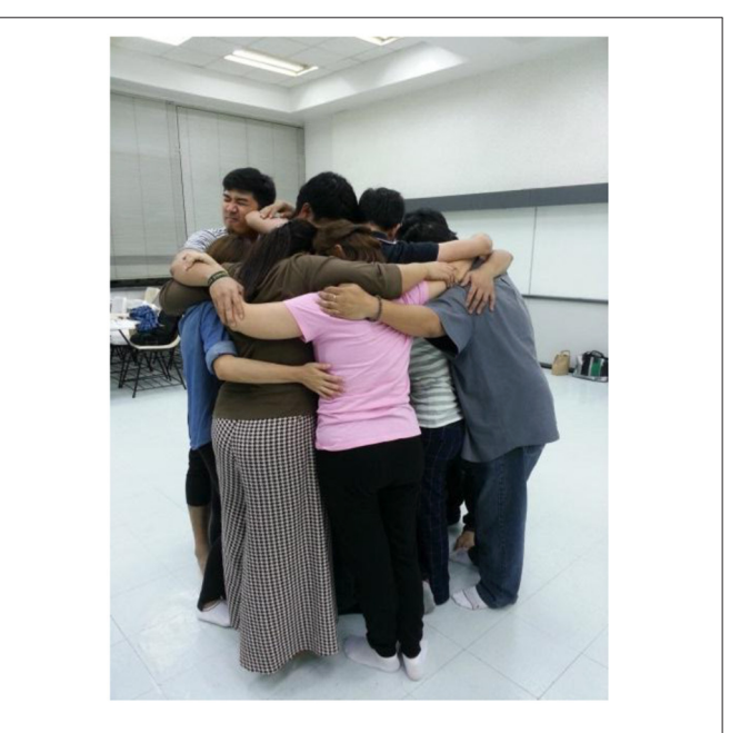
FIGURE 4 | The "comfort-table" hug at the end of the course.

This study was carried out in accordance with the recommendations of CU Ethical Board Committee. The protocol was approved by the CU Ethical Board Committee.