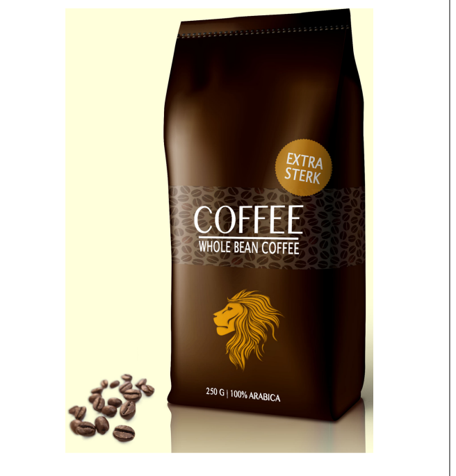
FIGURE 2 | Image on the bottom; the text claim.

or high reliability (Cronbach's \alpha above 0.70, according to Spector, 1991).