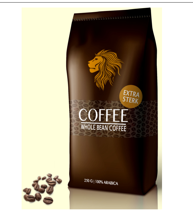
FIGURE 1 | Image on top; the text claim.