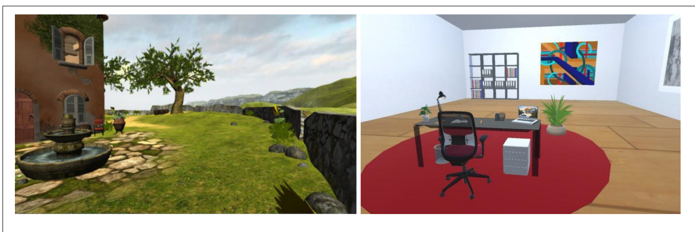
FIGURE 3 | Screenshots of the virtual garden scenery with a holiday cottage, trees, and a fountain (left) and of the virtual office with a desk, office chair, and other office supplies (right).

verbal instructions that did not include any time constraints. Participants in the no time pressure condition were greeted with no mention of time at all, no egg-timer was started, and participants were asked if everything was going well instead of being reminded to hurry up after 20 min. In fact, participants in the no time pressure and the time pressure condition had the same amount of time to conduct the experiment. To check the manipulation, we asked "Did you experience any time pressure during the experiment?" A higher rating indicated less subjective time pressure. Participants in the no time pressure condition (M = 5.29, SD = 1.73) experienced significantly less subjective time pressure compared to participants in the time pressure condition (M = 4.13, SD = 1.96), t(99) = 3.12, p = 0.002. Therefore, the manipulation of time pressure (time pressure being present or not) can be considered successful.