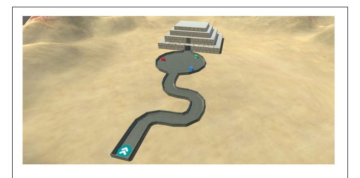
FIGURE 1 Design of the environment used in the movement control task. The environment can be subdivided in a meandering part, a circular area and a building featuring sharp turns. A mirrored version was created to accommodate for the two conditions.