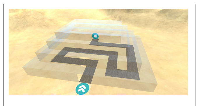
FIGURE 2 Design of the corridor with sharp turns used in the movement control task. The corridors inside the building are made up of 8, 90°; turns. The blue icon with arrows indicates the entrance of the building. The blue icon with the square indicates the end location of the task.