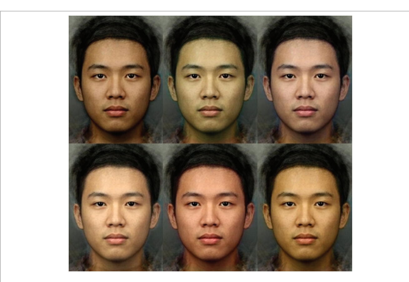
FIGURE 1 | CIELab color transformation of a face with decreased (top) and increased (bottom) lightness (L*, left); redness (a*, middle); and yellowness (b*, right). Presented face is a composite for illustration purposes, but photographs of real individuals were used as the stimuli.