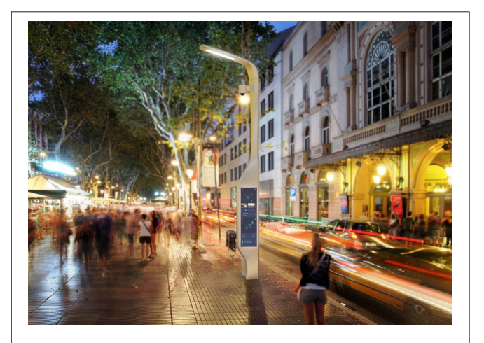
FIGURE 5 | Modeling image of smart view.

Furthermore, the users' needs within various social fields with urban issues can be closely understood through the needs map and reflected to the service development. Applying the needs map to not local but whole smart cites requires the management of an immense amount of data which is constantly updated. Needs from variously interested people who are men, women, residents, visitors, officials, etc. are also complicated and extensive. This demonstrates another reason why the needs map is necessary. The needs map proposes a new methodology through which user behaviors are classified, managed, and utilized for needs extraction and further service development creation for Smart cities. The classification of such large-scale data requires several filtering processes of data sets. In algorithms for Big Data Analysis, a filter or kernel is given in the form of a matrix and, in fact, the filtering process is a convolution of the filter with a data set. So, to design filters appropriate to the purpose is very important in data classification. The needs map should permeate these filter matrixes. This filter design for the need map will be our future study. Through our future study, we can analyse the current status of smart services in urban spaces and suggest directions for improving the Smart city services.