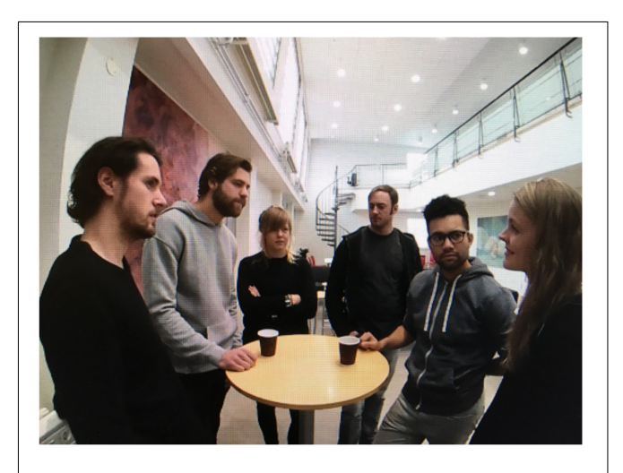
FIGURE 1 | First-person perspective of the group as experienced by participants in the IVE.

Though not exactly new, IVET presents psychologists with an opportunity to achieve higher ecological validity in the experimental setting, and to our knowledge, has yet to be used in the context of social exclusion research in this way. Some existing reports employ the term Immersive Virtual Environments (IVE) to refer to online social worlds in which exclusion can be manipulated via cyberball interactions (Kassner et al., 2012). However, in these studies, participants sat in front of computer screens and were not virtually "immersed" in the scene itself, as is now possible with the use of Virtual Reality headsets. These previous reports therefore focused on issues of agency in relation to avatars and agents. In our case, however, an Oculus Rift VR headset was used. Participants thus experienced the exact same experimental manipulation of either explicit or implicit exclusion from a social group through the firstperson perspective, as though they were actually standing in