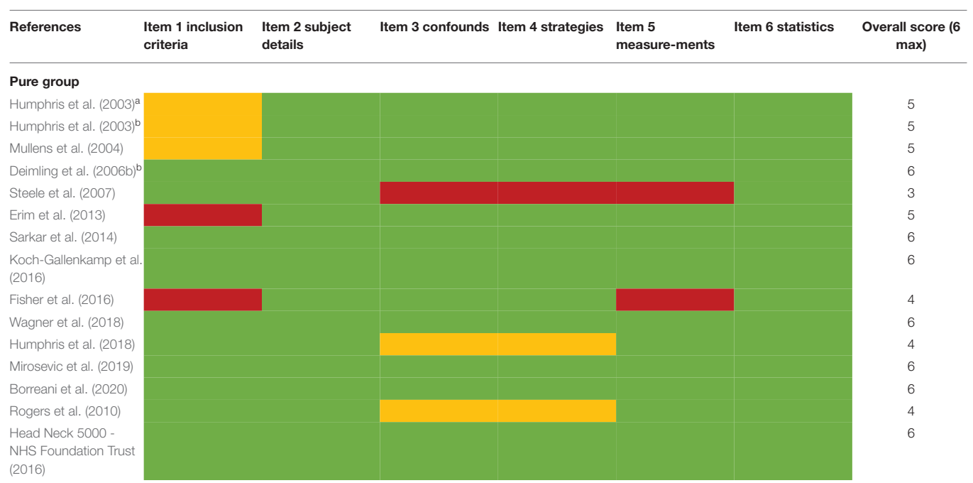
TABLE 2A | Quality assessment by modified Joanna Briggs tool on the included studies in pure group.

Green = "Yes"; Red = "No"; Yellow = "Unclear/Not applicable." The <sup>a,b</sup> mean to differentiate them as described in Results-Study Selection.