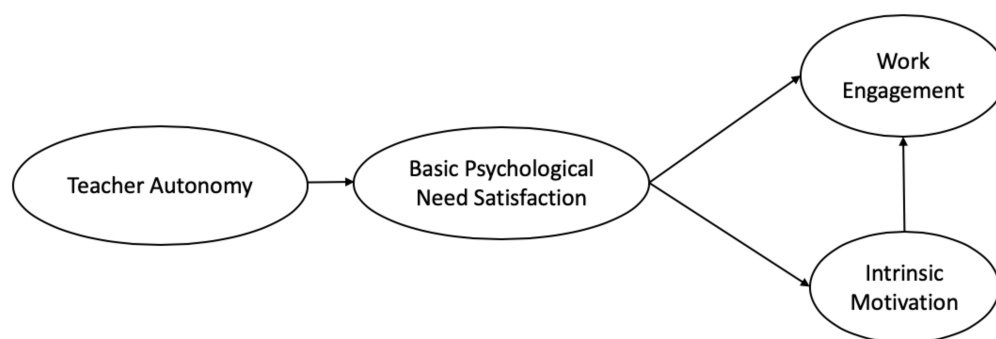
FIGURE 1 | Self-determination theory model showing hypothesized relationships between teacher autonomy, satisfaction of basic needs (autonomy, competence, and relatedness), intrinsic motivation, and engagement.

The first "intrinsic motivation" part of the Teaching Motivation Scale compiled by Zhong, Shen, and Xin in 1999 was adopted in this study. The scale included 7 Likert-scaled items, with