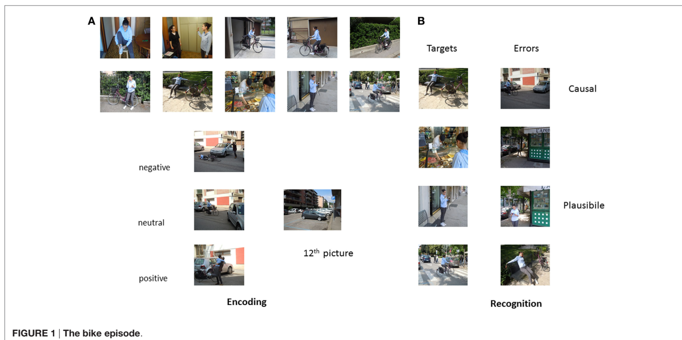
FIGURE 1 | The bike episode.

SD = 0.94), t(16) = 12.62 , p < 0.001 and positive outcomes had higher valence ( M = 7.67 , SD = 0.79), t(16) = -15.04 , p < 0.001 , than neutral outcomes ( M = 5.04 , SD = 0.45). Furthermore, arousal was significantly higher in both negative ( M = 7.40 , SD = 0.88), t(16) = -8.74 , p < 0.001 , and positive outcomes ( M = 6.90 , SD = 0.93), t(16) = -12.92 , p < 0.001 , than in neutral outcomes ( M = 3.89 , SD = 1.30). Finally, although arousal was slightly higher in the negative than in the positive outcomes, the difference did not reach significance, t(16) = 1.64 , p = 0.12 .