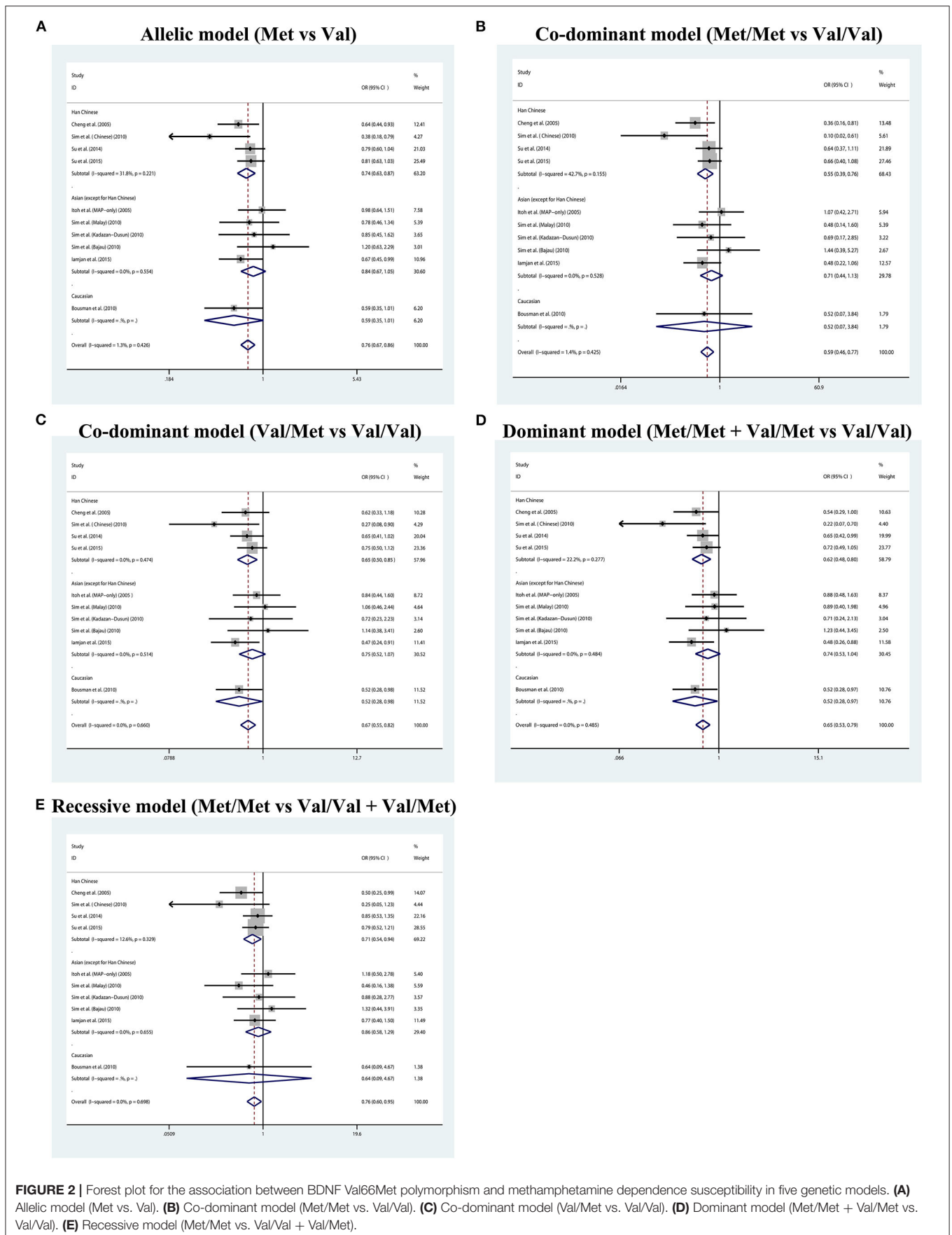
FIGURE 2 | Forest plot for the association between BDNF Val66Met polymorphism and methamphetamine dependence susceptibility in five genetic models. (A) Allelic model (Met vs. Val). (B) Co-dominant model (Met/Met vs. Val/Val). (C) Co-dominant model (Val/Met vs. Val/Val). (D) Dominant model (Met/Met + Val/Met vs. Val/Val). (E) Recessive model (Met/Met vs. Val/Val + Val/Met).