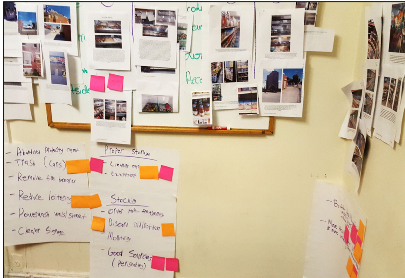
FIGURE 3 | Photograph of theme clusters assembled during Community Meeting 1 in Camden, New Jersey (September 2016).