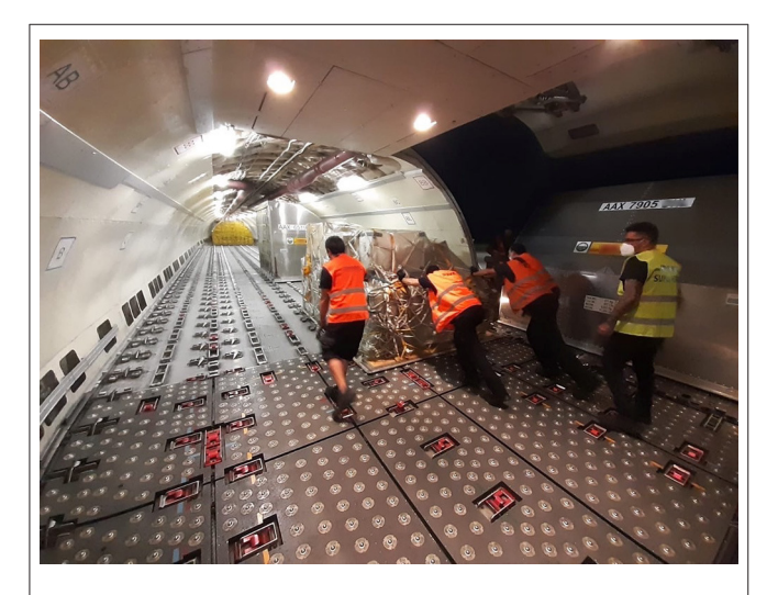
FIGURE 2 | The unit load device (ULD) is pushed by the operators inside the upper deck of a Cargo Aircraft.

pain with a diagnosis of disc disease and one worker suffers from chronic epicondylitis. Thirty-two workers (57%) regularly perform exercise at least twice a week.